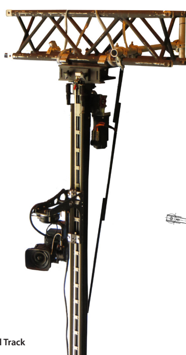
Inverted Vertical Track