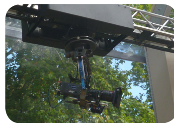
with Libra head & Arri Alexa