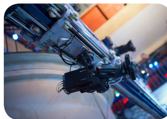
NTS Flown track