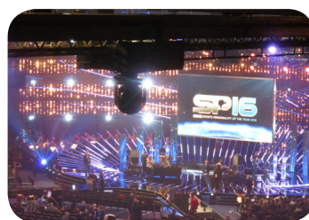
with HD Cineflex V14